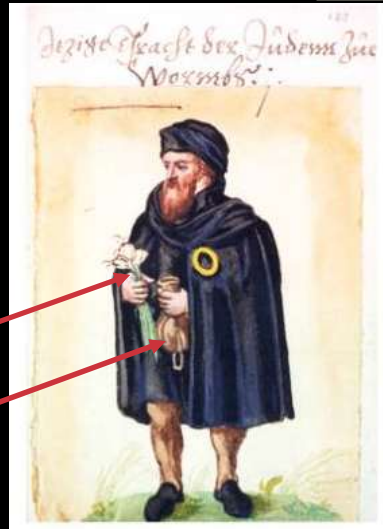
Image of a Jew from Worms, Germany, late 16th century