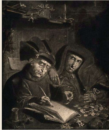
Depiction of two Jews counting money