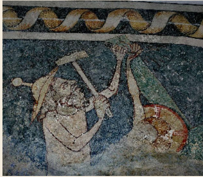
14th century fresco depicting a Jew nailing Jesus to the cross.