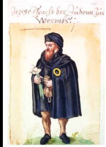
Image of a Jew from Worms, Germany, late 16th century