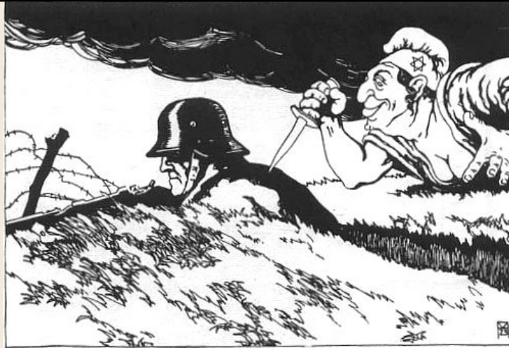
Image from a 1919 Austrian postcard