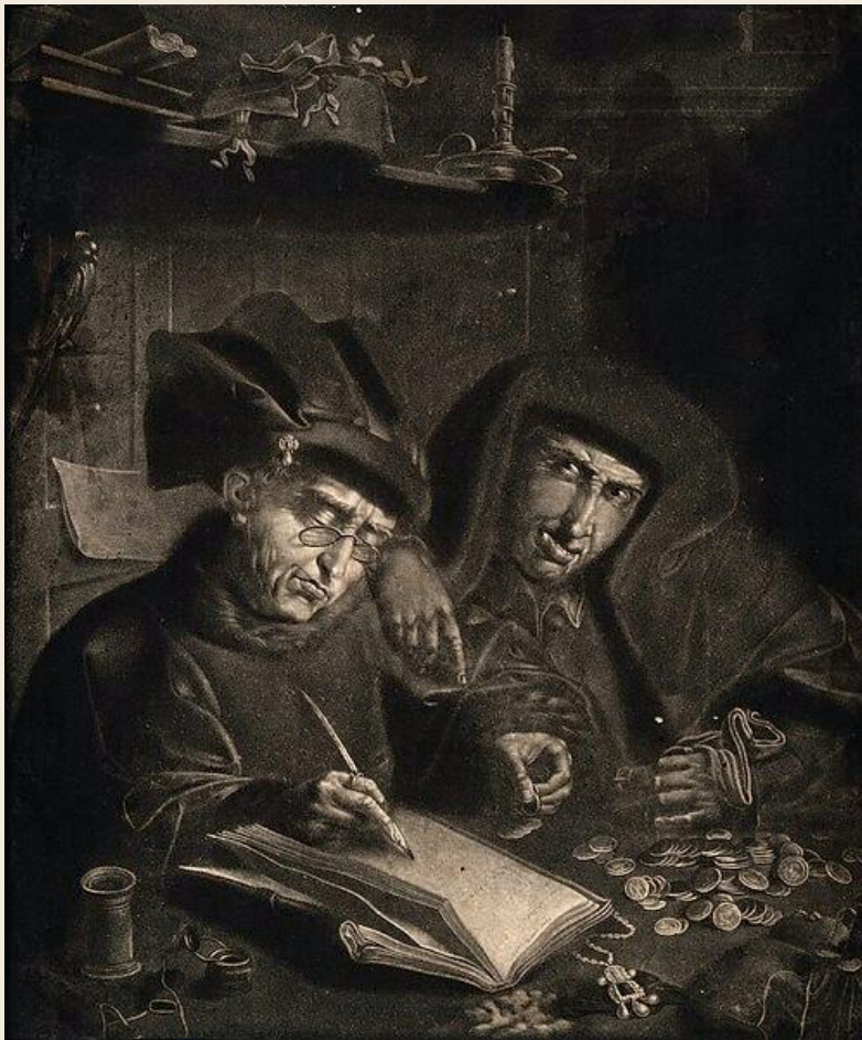
Depiction of two Jews counting money