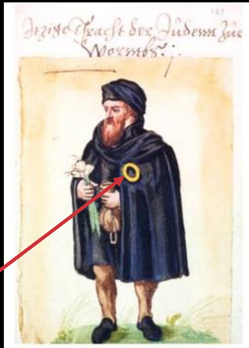
Image of a Jew from Worms, Germany, late 16th century