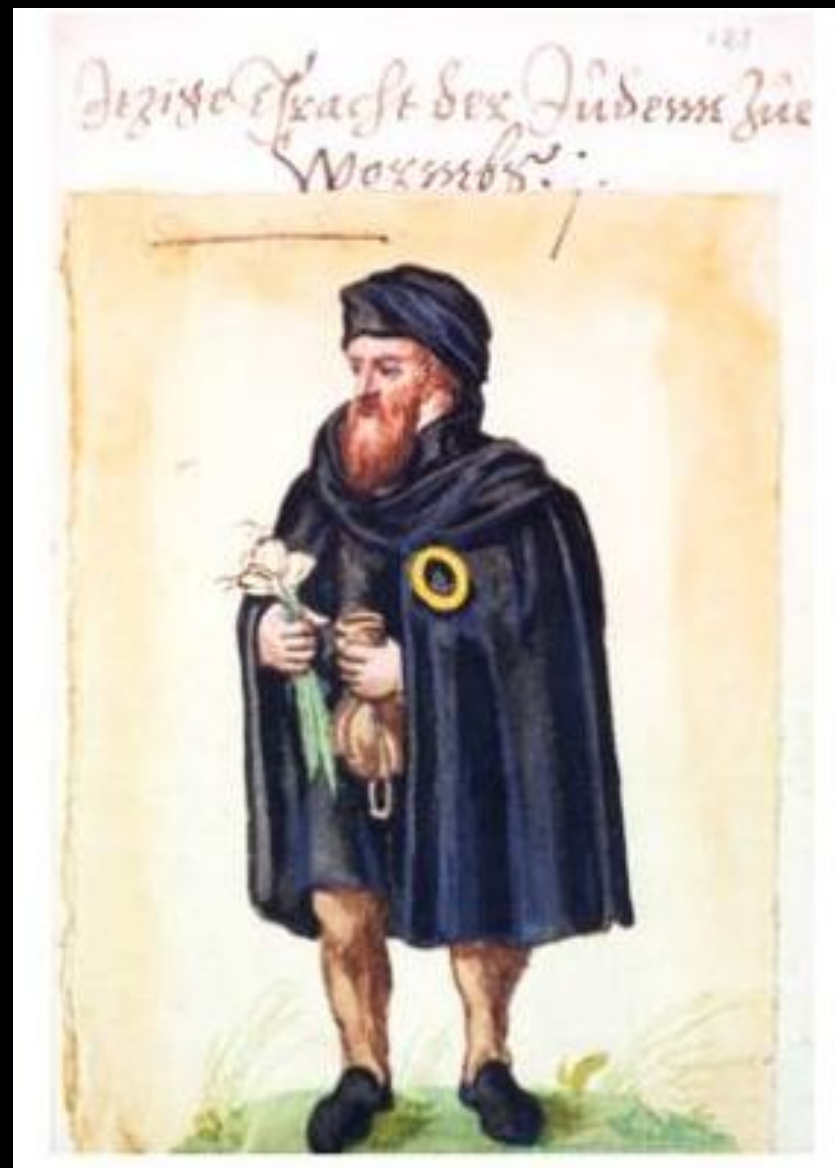
Image of a Jew from Worms, Germany, late 16th century