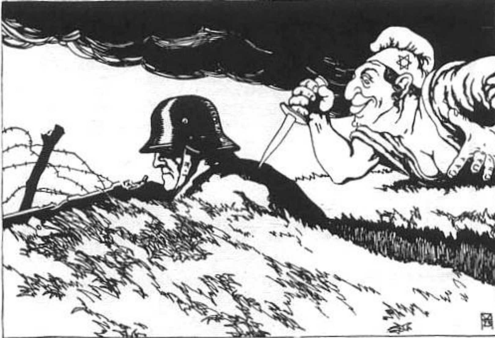
Image from a 1919 Austrian postcard