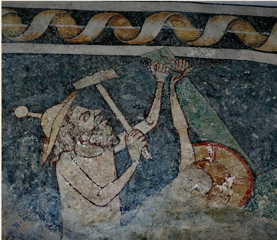
14th century fresco depicting a Jew nailing Jesus to the cross.