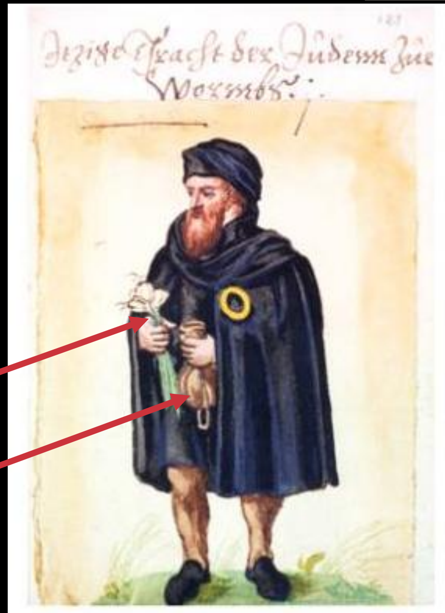
Image of a Jew from Worms, Germany, late 16th century